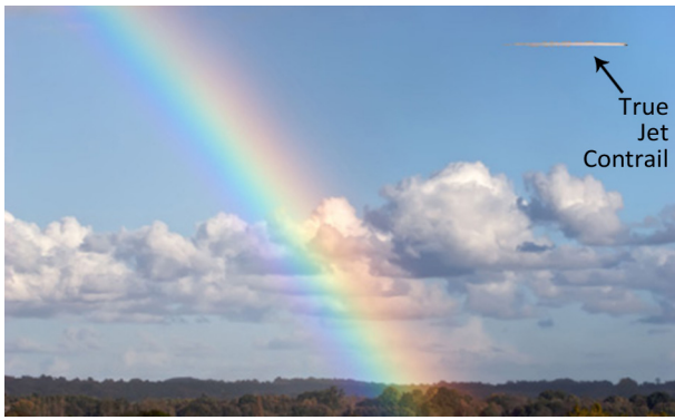
True jet contrails are rare, like rainbows.